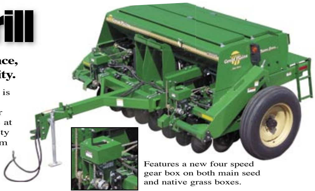
Features a new four speed gear box on both main seed and native grass boxes.

The 7' and 10' End Wheel Drills feature large end wheels designed for unmatched ground gauging in rugged pasture terrain. In addition, the in-line end wheels minimize side-loading on contours and side-hills, dramatically extending the life of the no-till openers. Other features include 4-speed gearboxes, automatic clutch for end row field turns and rain tight lids for maximum seed and fertilizer protection.